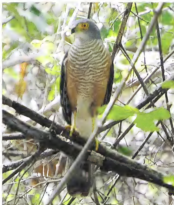
Figure 5. Red-chested Goshawk / Autour de Toussenel Accipiter toussenellii , Dindéfello Nature Reserve, Senegal, September 2010

An adult photographed in gallery forest in March 2010 (Fig. 5). Mainly restricted to the Casamance, with scattered records in the Gambia River basin,